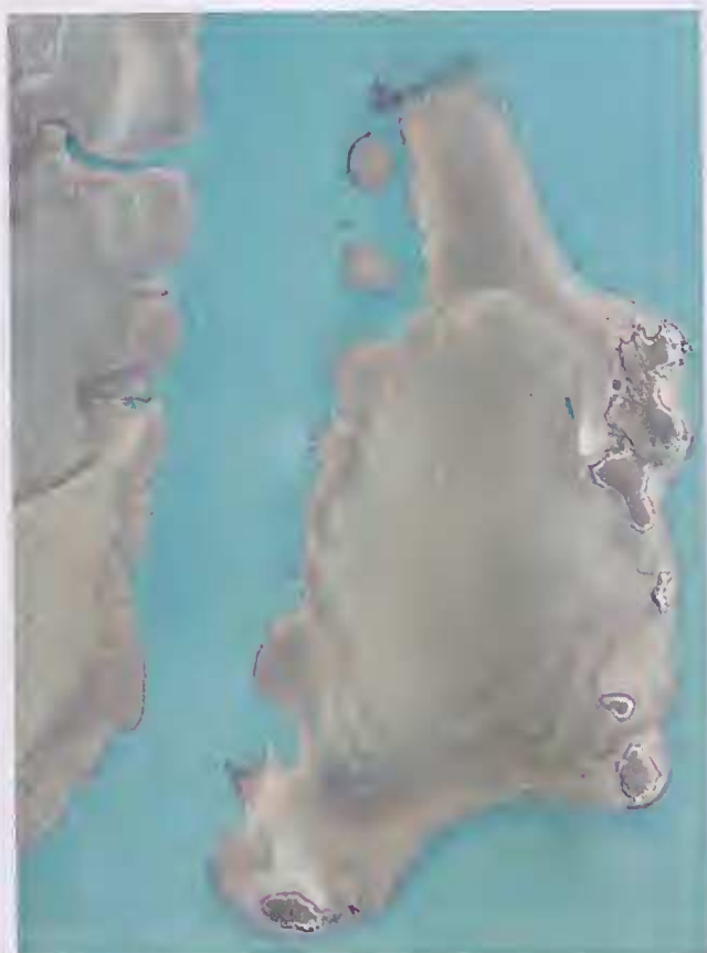
Figure 2. High Clifty Reef with its five small islands, separated from the main Montgomery Reef platform by a deep channel.

largely surrounded by sand sheets. There are also eight small rocky islands on the eastern margin of the complex. They include five islands, known collectively as the High Clifty Islands, arranged around the eastern and southern fringe of High Clifty Reef (Fig. 2). The other three are located on or near the eastern margin of the main Montgomery Reef and are known as the dual Egret Islands (Fig. 3) (referred to as Jungadi by Roy Wiggan) and Wuljarlu Island (Fig. 4).